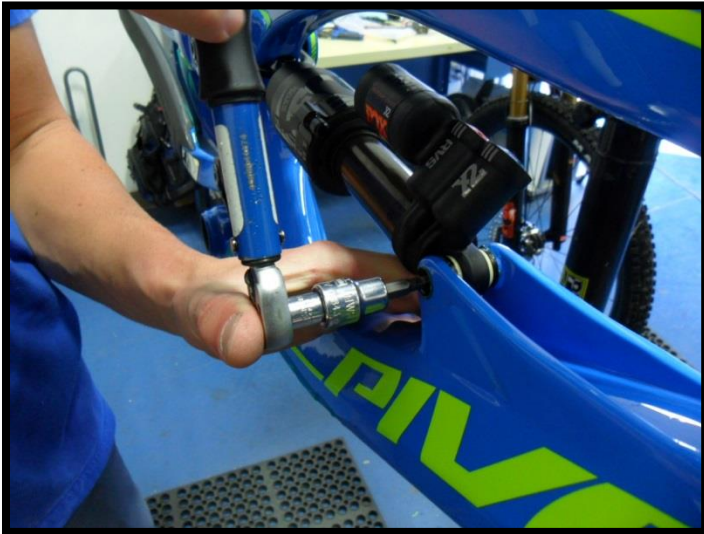
Step 9. Torque front shock bolt to 13 Nm.