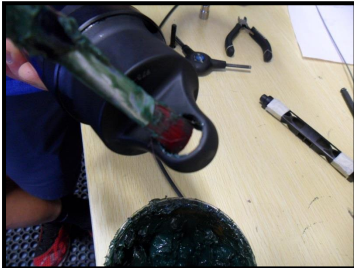
Step 2. Grease shock eyelet (inside)