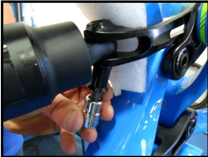
Step 5. Install clevis shock bolt first.