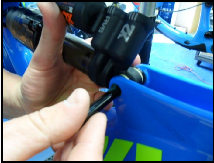
Step 7. Install front shock bolt