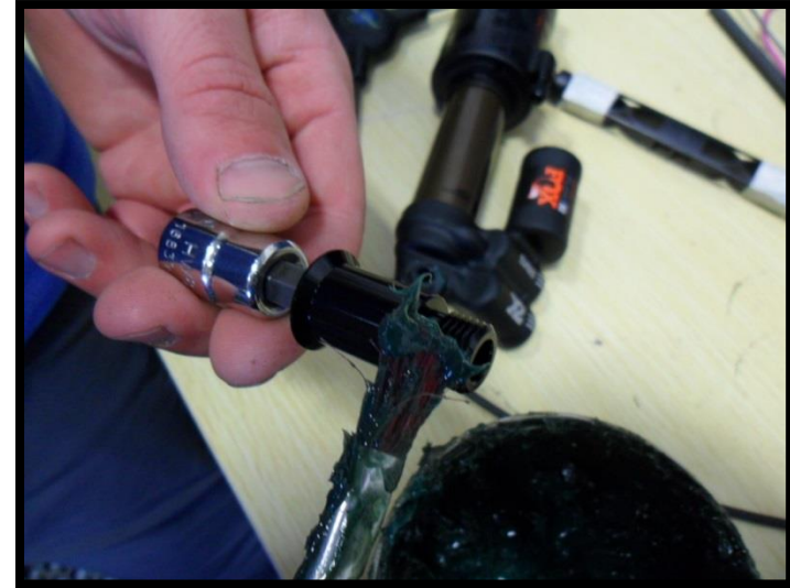
Step 4. Grease clevis shock bolt.