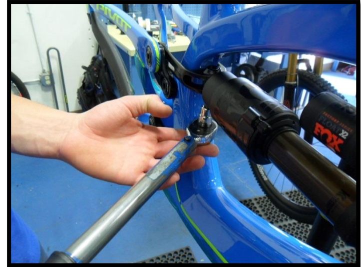
Step 8. Torque clevis shock bolt to 24 Nm.