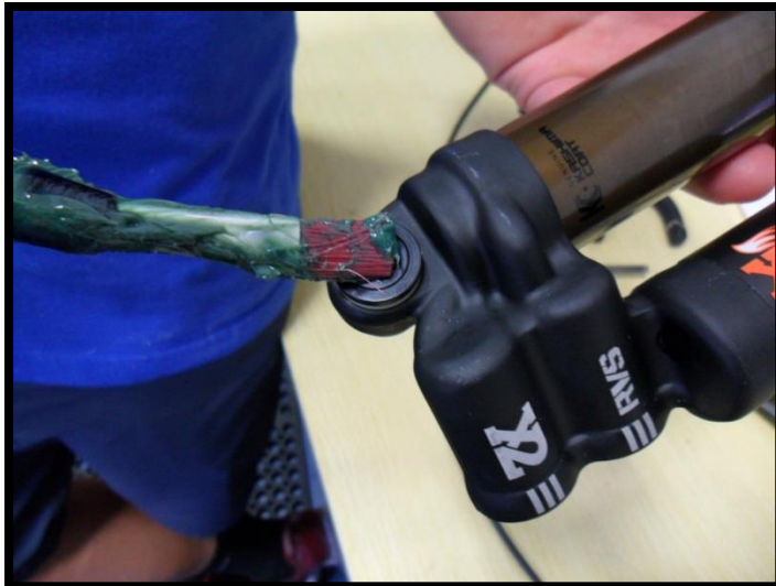
Step 1. Grease shock spacer (both sides)