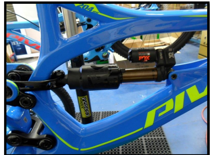
Step 10. Finished