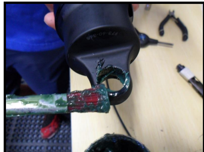
Step 2. Grease shock eyelet (outside)