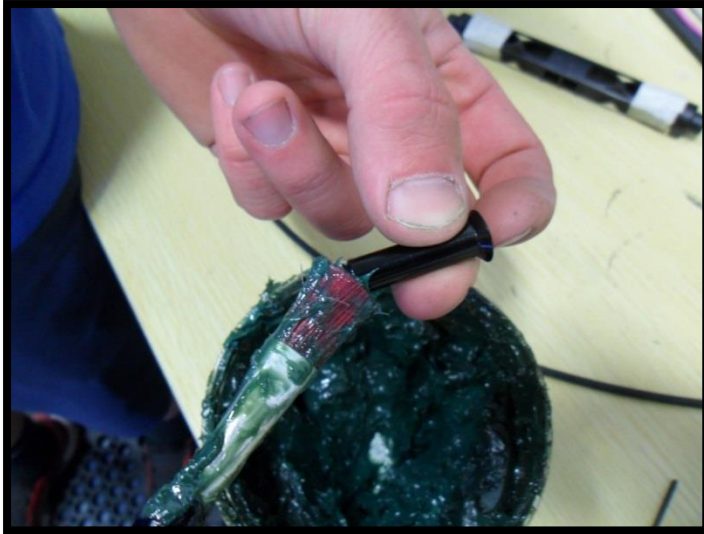
Step 3. Grease front shock bolt.