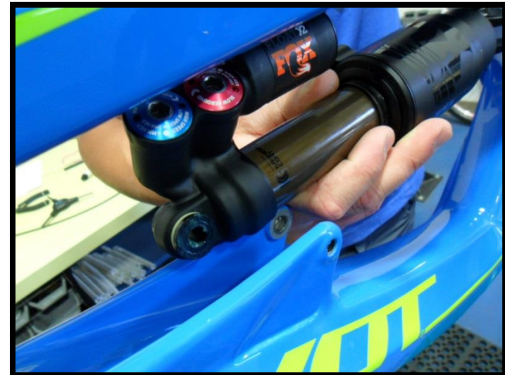
Step 6. Install front of shock over shock tabs.